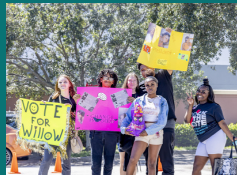
Students campaigning for SGA elections.

The bash introduced many new business and educational partners including iThink Financial, RACK Electric, YouFit Gyms, the Health Council of Southeast Florida, RISE Dance Studio and COMPASS. Students enjoyed music and a bounce house sponsored by iThink as well as a catered lunch sponsored by 365 Squad Catering. The US Army reps were also onsite informing students about requirements for registering in the military.