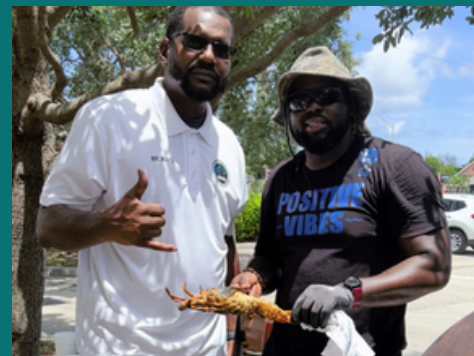
Rock the Vote event lunch by 365 Squad.